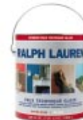
RALPH LAUREN FAUX TECHNIQUE GLAZE