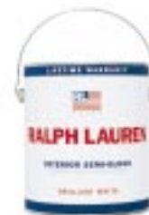
RALPH LAUREN LATEX SEMI-GLOSS OR SATIN FINISH