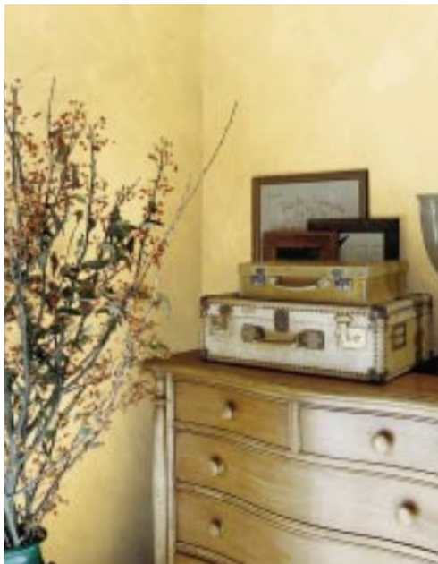
ABOVE: B ROADSTER WHITE • WW31 G WALNUT • NA07

Creating the illusion of subtle texture, colorwashing softly blends complementary hues, using the interplay of combined light and dark tones to bring rich character into your space.